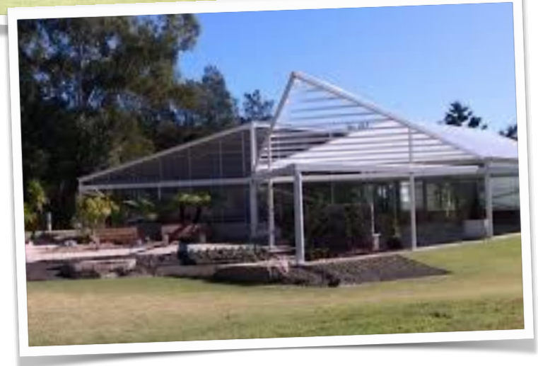
the enjoyment and education

12:30pm. Lunch at the Surf Club. We will adjourn for lunch to the Coffs Harbour Surf Club at 23 Surf Club Road Coffs Harbour, where the views are spectacular, the food is yummy and with our attendance the company will be bubbly. It will be an easy going, select from the menu, lunch. See what's on offer at <a href="https://www.surfclubcoffsharbour.com.au">www.surfclubcoffsharbour.com.au</a>